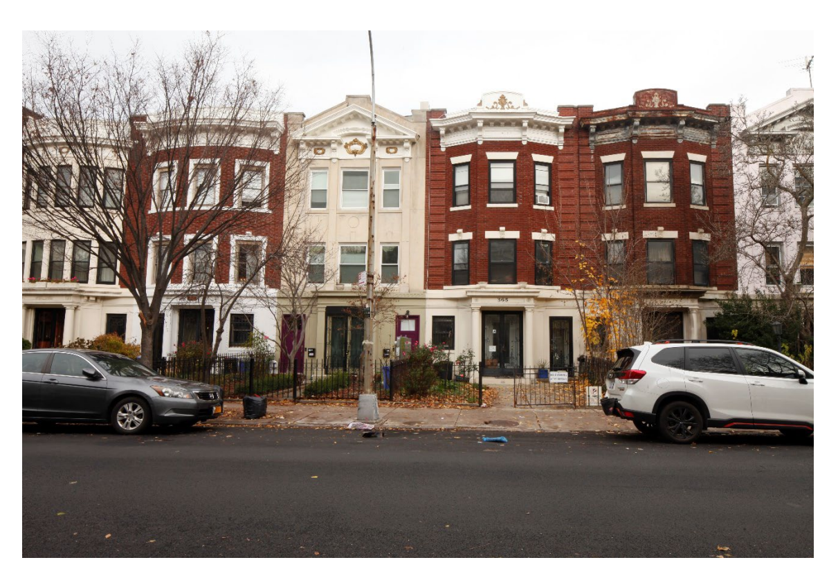
American Basement Plan Houses, 359-367 Parkside Avenue Bilge Kose, LPC, December 2022