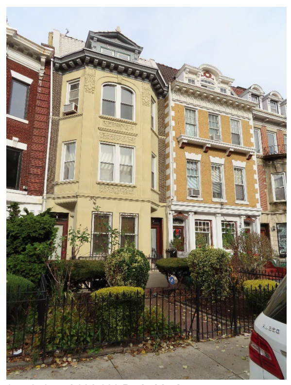
377-379 and 381-383 Parkside Avenue (Duplex E and F types) Joel Feingold, LPC, December 2022