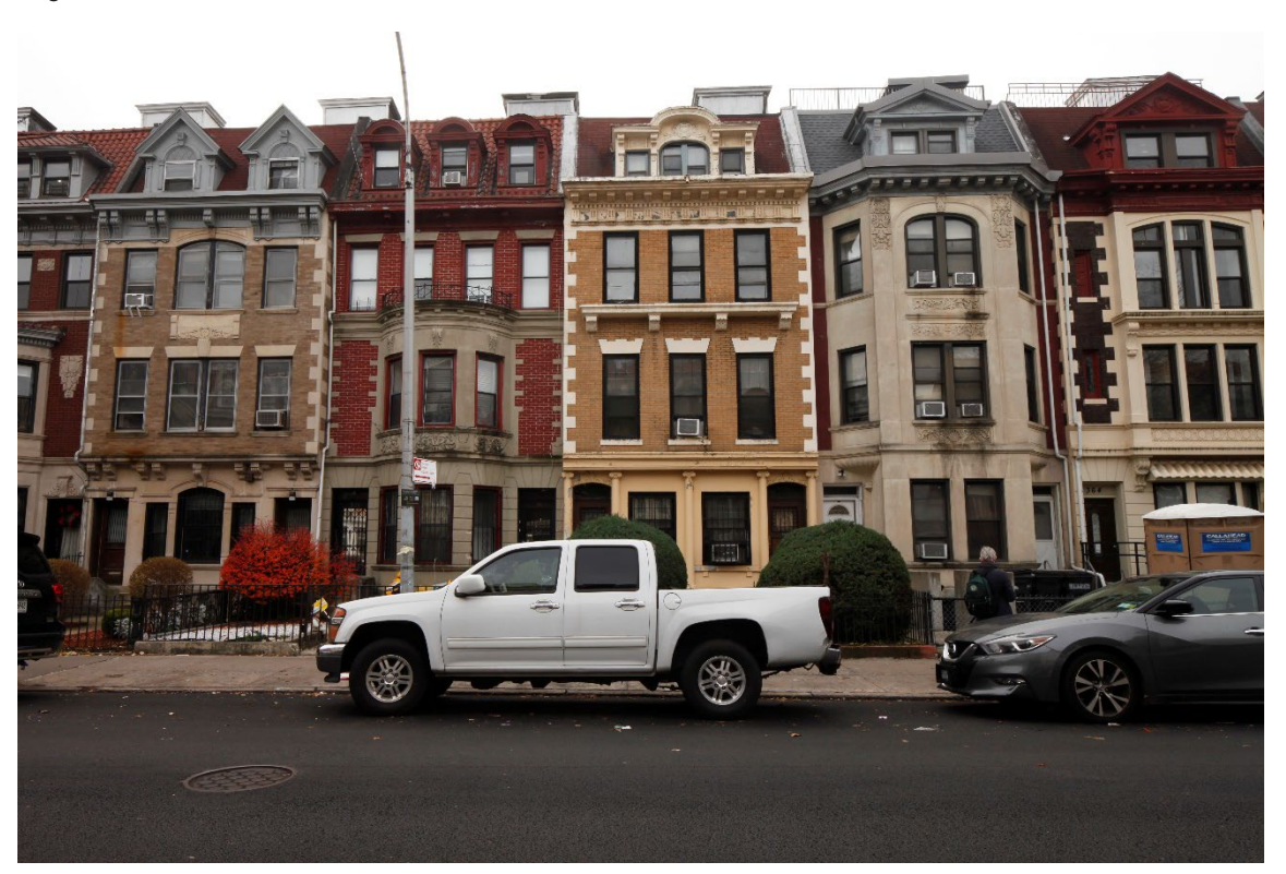
Duplex Houses 382-384 to 362-364 Parkside Avenue Bilge Kose, LPC, December 2022