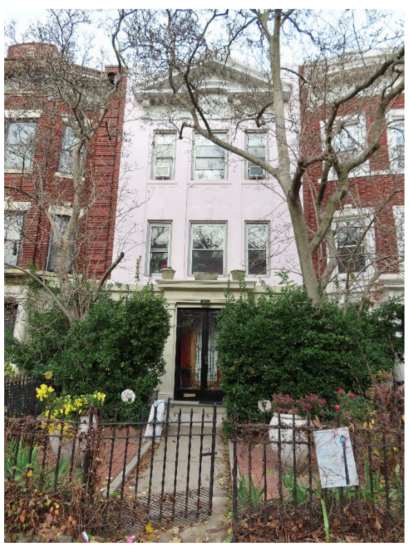
369 Parkside Avenue Bilge Kose, LPC, December 2022