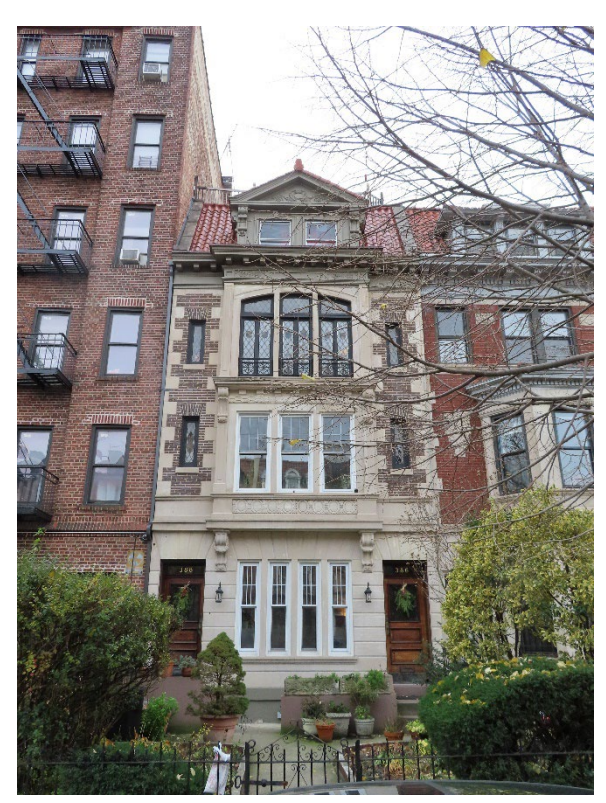
386-388 Parkside Avenue (Duplex D type) Joel Feingold, LPC, December 2022