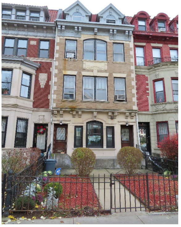
378-380 Parkside Avenue (Duplex B type) Bilge Kose, LPC, December 2022