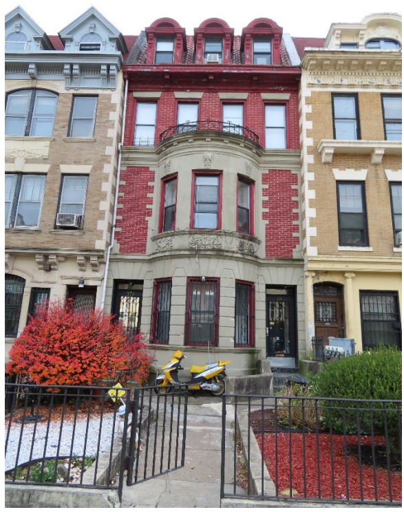
374-376 Parkside Avenue (Duplex A type) Bilge Kose, LPC, December 2022