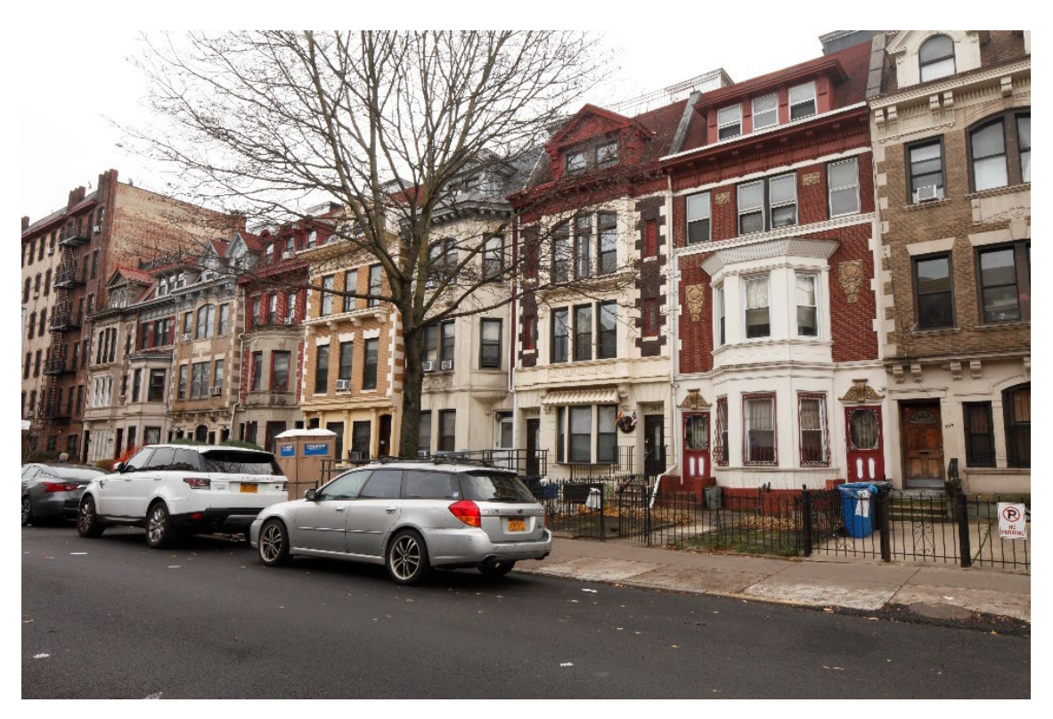
Parkside Avenue South Side Bilge Kose, LPC, December 2022