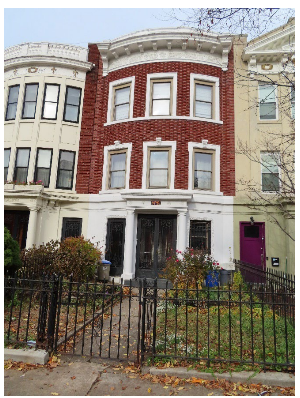
361 Parkside Avenue Bilge Kose, LPC, December 2022