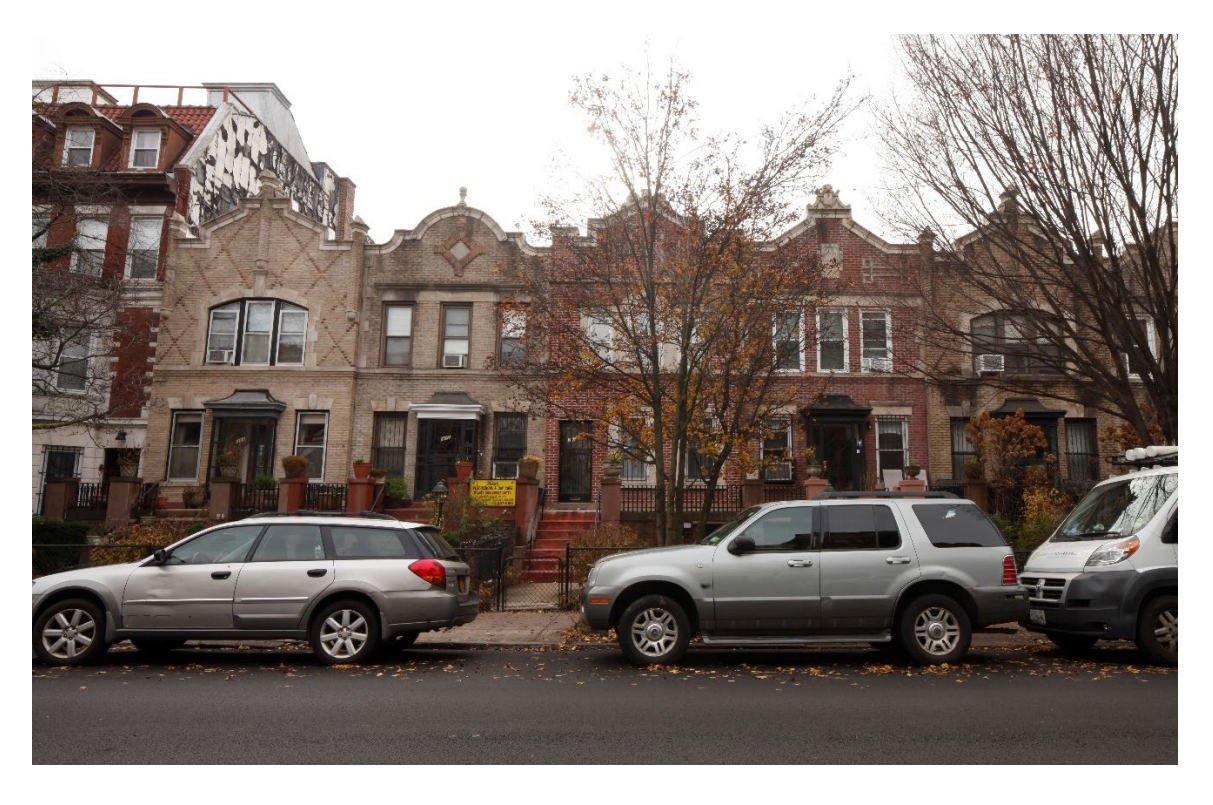
"No Basement/Easy Housekeeping" Houses, 304-296 Parkside Avenue Bilge Kose, LPC, December 2022