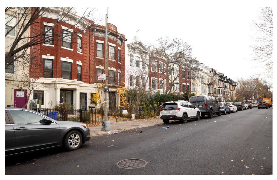
Parkside Avenue North Side Bilge Kose, LPC, December 2022