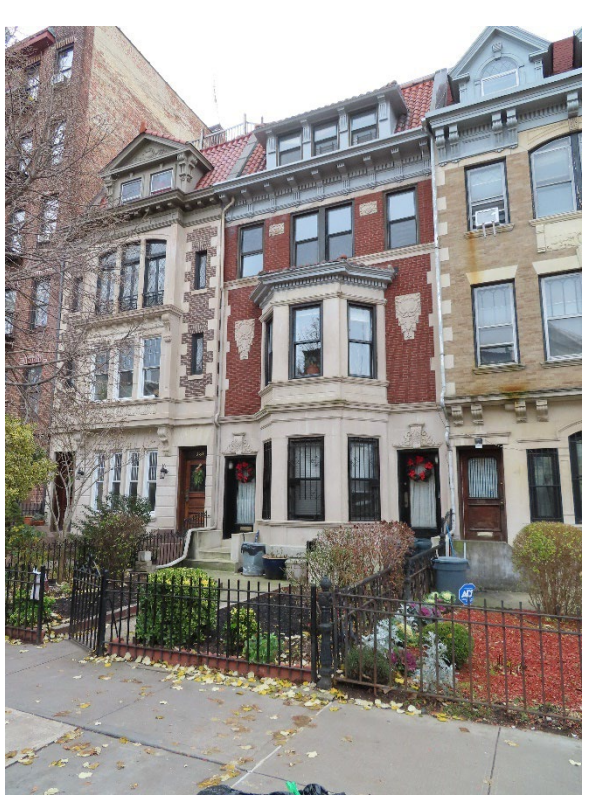
382-384 Parkside Avenue (Duplex C type) Joel Feingold, LPC, December 2022